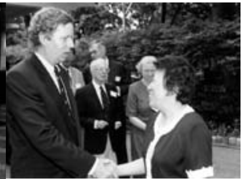
獲多倫大大學校長頒予傑出服務貢獻獎 (1998) Presented Arbor Award by President of University of Toronto to express Appreciation for Outstanding Volunteer Work to University of Toronto (1998)