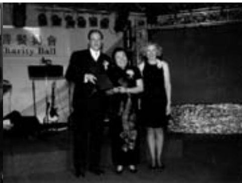
獲百年醫院頒獎、表揚為醫院籌款的 突出表現 (1995) Awarded by Centenary Health Centre for Outstanding Fundraising Performance as the Co-chair of Charitable Ball (1995)