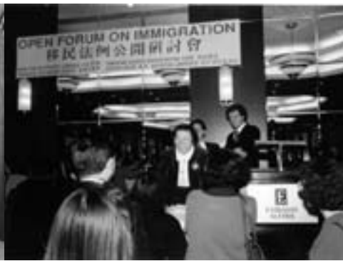
與加國移民部舉行有關移民講座 (1994) Organized an Open Forum on Immigration (1994)