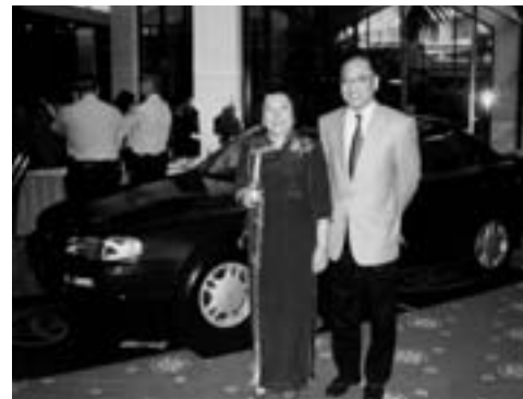
任紅河谷醫院擔任籌款會主席 (1997) As Honorary Chair of Fund Raising for Rouge Valley Hospital (1997)