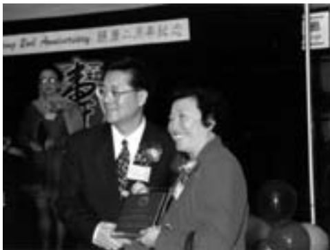
獲頭康基金會委任為籌款委員會成員 (1996) Appointed as Member of Board of Governors by Yee Hong Community Wellness Foundation (1996)