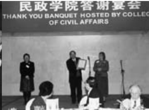
協助多倫多大學為中國民政學院提供培訓該校 的社會工作老師；獲該學院頒發的感謝 (1997) An appreciation from College of Civil Affairs, Beijing for arranging Faculty of Social Work, University of Toronto to train China Social workers (1997)