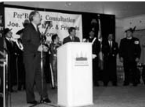
負責組織為胡平藻競選為議員的活動， 並邀請前馬田總理為主講嘉賓 (2002) Organized Election Campaign for Joe Volpe, Rt. Hon. Paul Martin attended as Key Note Speaker (2002)