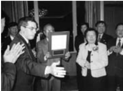
陪同安省交通廳長 Tony Clement 訪問 上海交通部 (1995) Accompanied Ontario Transport Minister, Tony Clement, to visit Shanghai Ministry of Transport (1995)