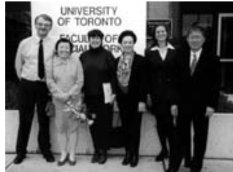
獲多倫多大學社會工作學院頒予該學院 的安省獎學金主席 (1997) Awarded the Chair of Ontario Graduate Scholarship at the Faculty of Social Work, University of Toronto (1997)