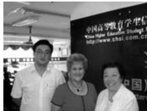
參加北京清華大學舉行的國際愛滋病 與沙士病研討會 (2002) Attended an International Symposium of AIDS & SARS held in Beijing by Tsinghua University (2002)